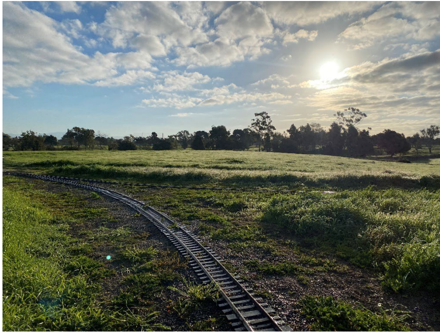
Our Beautiful Railroad