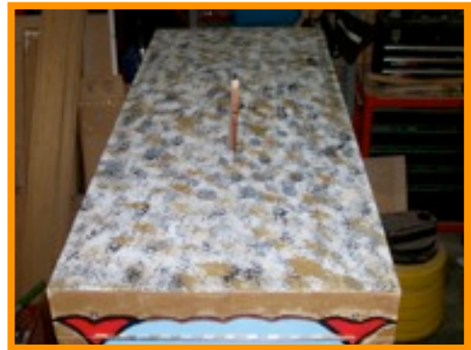
The slot on the top of the box that holds the special event plaque