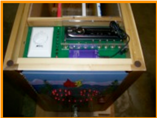
The Main Control Panel