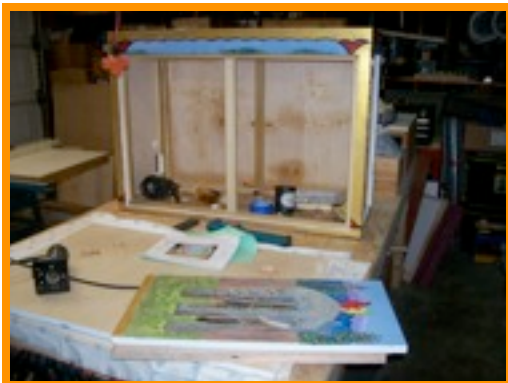
The construction of the main box