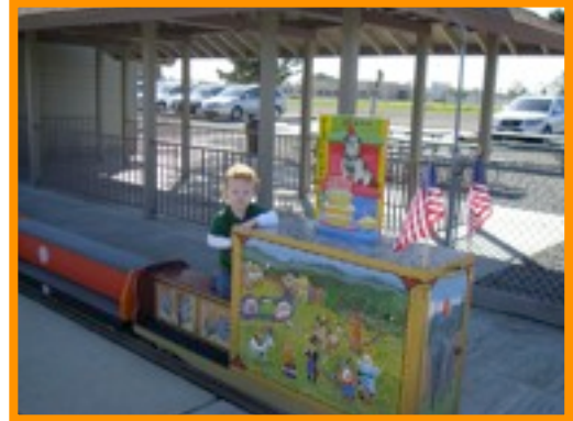
The "Happy Birthday" plaque