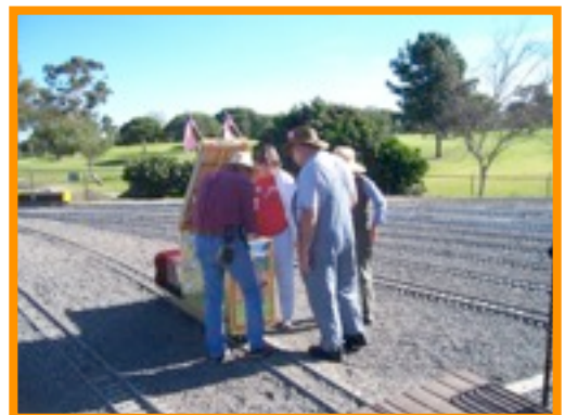
Let's fire it up