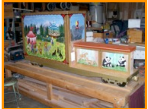
Ready to be shipped