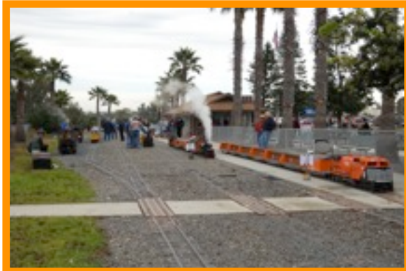
Trains & crews lined up at the station ready for passengers