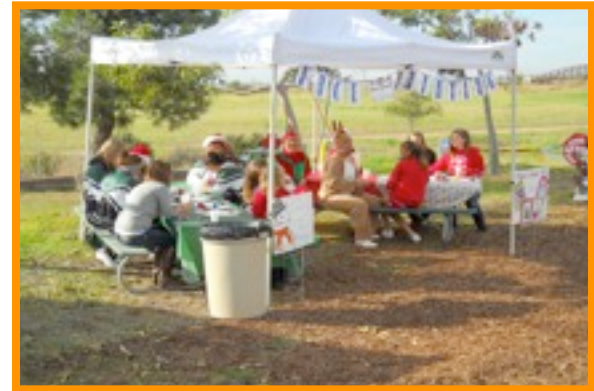
Children enjoying face painting and crafts