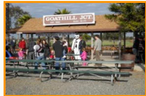
Frosty the Snowman greeting visitors arriving at Goat Hill Junction station