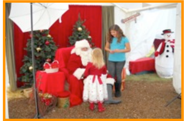
2 young ladies enjoying a visit with the Polar Express Santa