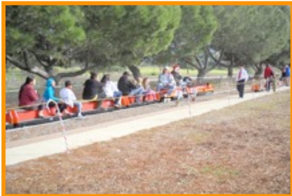
"1104" arriving at the North Pole Station