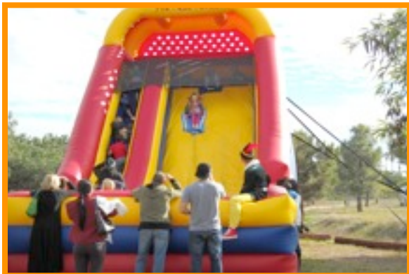
"Reindeer in training" at the North Pole Station