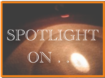
OCME's 2010 Pumpkin Patch Run