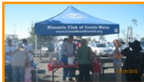
"Thank You" Kiwanis.