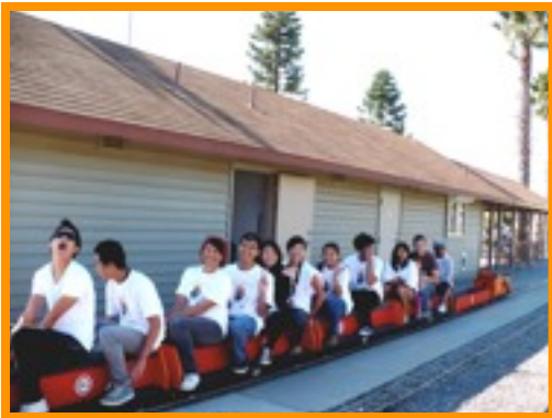
Our "Super" Volunteers