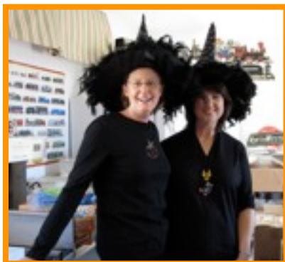
The "Harvey Girls" dressed for Halloween