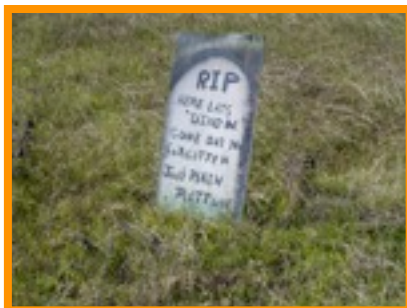
Tombstone found on Witch Mountain