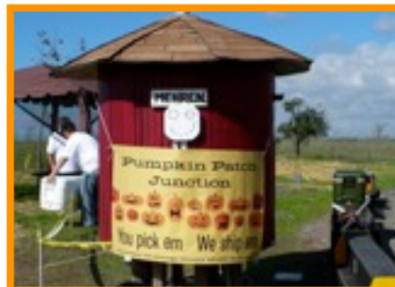
Welcome to Pumpkin Patch Junction