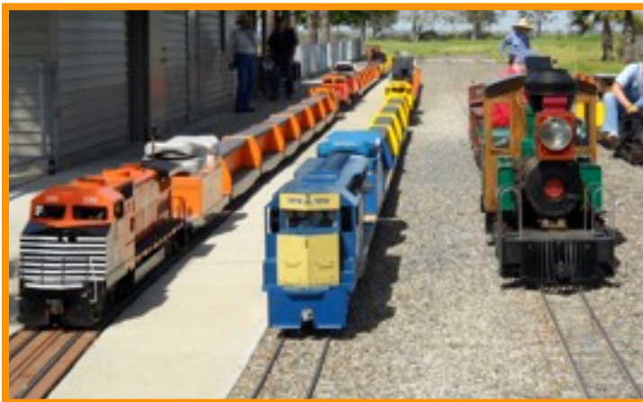
“Gentlemen, Start Your Engines!”

WHAT A GREAT TURNOUT WE HAD OF ENGINEERS, CONDUCTORS AND ALL AROUND GOOD HELPERS!