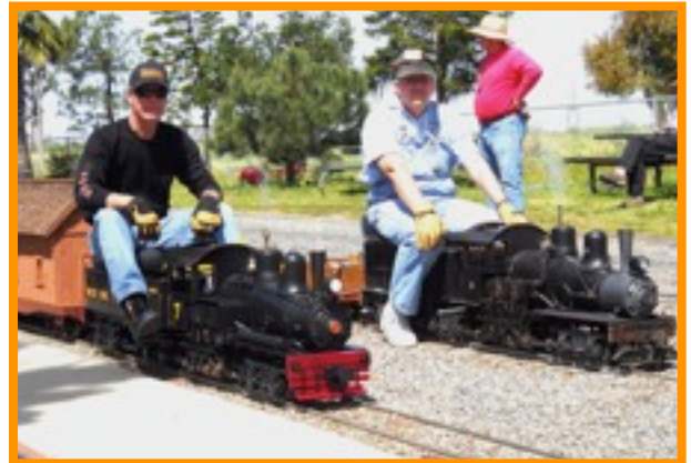
“What Did You Shay?”

On Saturday, March 27, 2010 OCME hosted the Raise Foundation's Family Festival Fun Day, which featured free train rides, face painting, arts & crafts, fire trucks, an ambulance, live music, bounce houses, resource booths from other participating organizations and food for purchase. Our trains ran from 10:00 a.m. to 11:30 a.m. and 12:30 p.m. to 2:30 p.m. and during that time we gave fun rides to almost 1,300 people. We can be proud of ourselves in that we had lots of trains of every type (solar-powered, steam and gas) and crews for all these trains. Here are our trains queued up for the start of the afternoon runs.