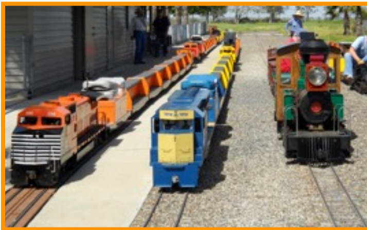
“Gentlemen, Start Your Engines!”

WHAT A GREAT TURNOUT WE HAD OF ENGINEERS, CONDUCTORS AND ALL AROUND GOOD HELPERS!