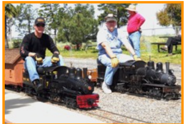
“What Did You Shay?”

On Saturday, March 27, 2010 OCME hosted the Raise Foundation's Family Festival Fun Day, which featured free train rides, face painting, arts & crafts, fire trucks, an ambulance, live music, bounce houses, resource booths from other participating organizations and food for purchase. Our trains ran from 10:00 a.m. to 11:30 a.m. and 12:30 p.m. to 2:30 p.m. and during that time we gave fun rides to almost 1,300 people. We can be proud of ourselves in that we had lots of trains of every type (solar-powered, steam and gas) and crews for all these trains. Here are our trains queued up for the start of the afternoon runs.