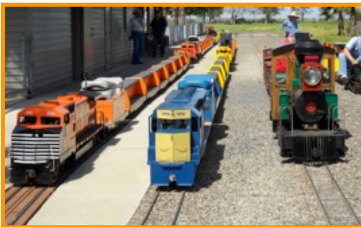
“Gentlemen, Start Your Engines!”

WHAT A GREAT TURNOUT WE HAD OF ENGINEERS, CONDUCTORS AND ALL AROUND GOOD HELPERS!